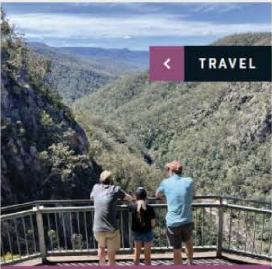
Gorge at Boonoo Boonoo National Park.

fall asleep while gazing at a starry constellation and wake up to a glorious sunrise without even having to leave the tent, or your bed.