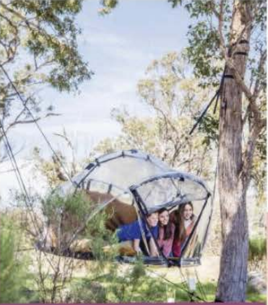
Kids camping at Mirumiru.