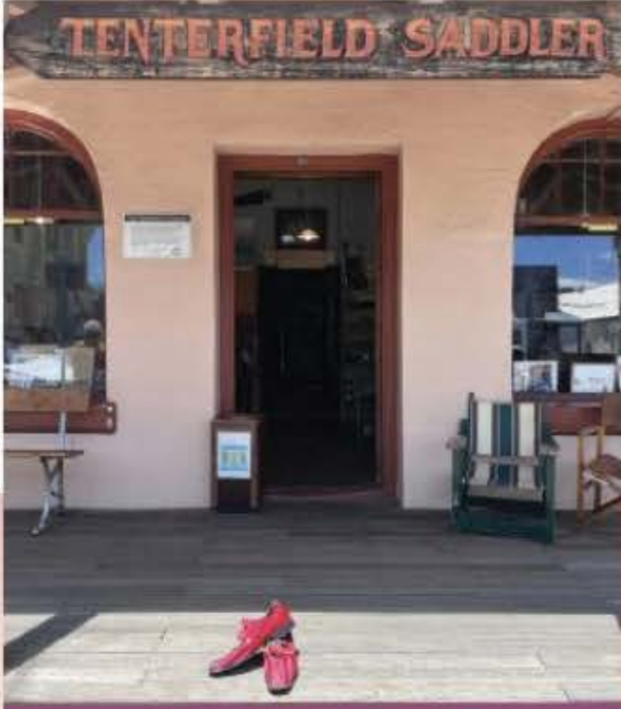
The Tenterfield Saddler.

farm gates. But my fondest memories involved sitting around the campfire at Mirumiru, with a glass of local red in hand, and our bubbletent behind us, emitting a warm glowing light.